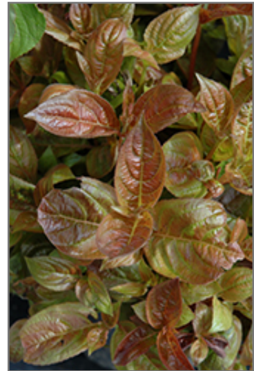
Wings Of Fire Weigela foliage