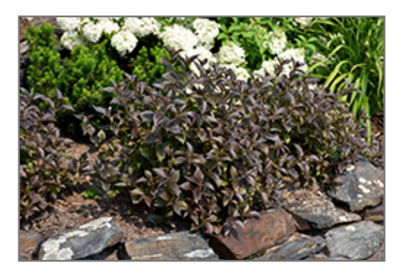
Tango Weigela

This shrub should only be grown in full sunlight. It prefers to grow in average to moist conditions, and shouldn't be allowed to dry out. It is not particular as to soil type or pH. It is highly tolerant of urban pollution and will even thrive in inner city environments. This is a selected variety of a species not originally from North America.