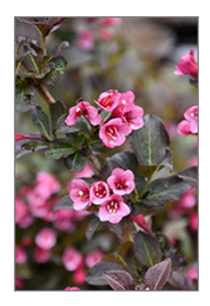
Tango Weigela flowers

Tango Weigela is recommended for the following landscape applications;