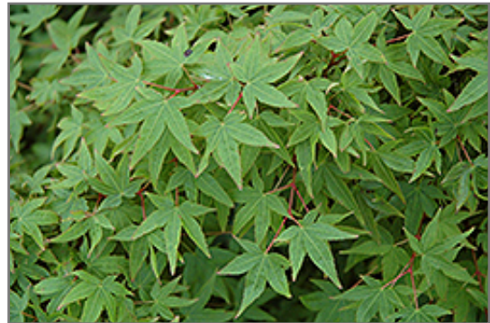
Tama Hime Japanese Maple foliage