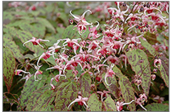
Pink Champagne Fairy Wings flowers