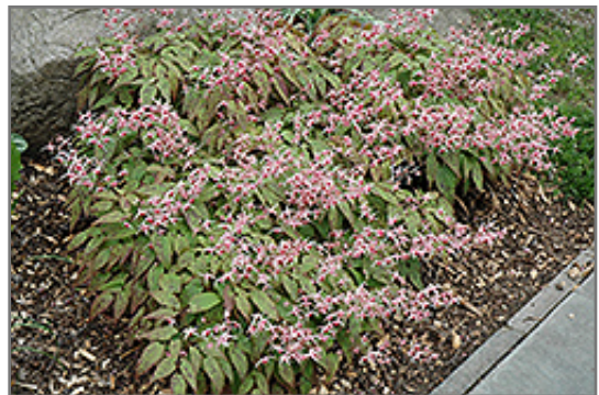
Pink Champagne Fairy Wings in bloom