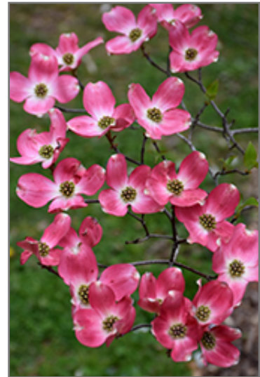
Red Flowering Dogwood flowers

Red Flowering Dogwood is recommended for the following landscape applications;