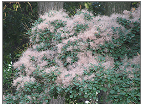
American Smoketree in bloom