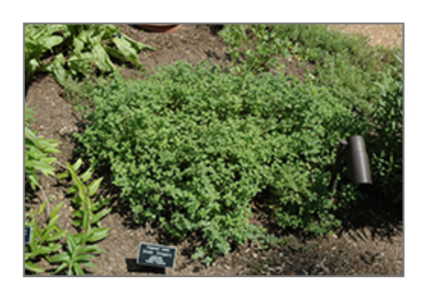
Greek Oregano

This is an herbaceous evergreen perennial herb with a mounded form. It brings an extremely fine and delicate texture to the garden composition and should be used to full effect. This is a relatively low maintenance plant, and should be cut back in late fall in preparation for winter. It is a good choice for attracting bees and butterflies to your yard, but is not particularly attractive to deer who tend to leave it alone in favor of tastier treats. It has no significant negative characteristics.