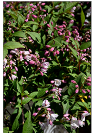
Yuki Cherry Blossom Deutzia flowers