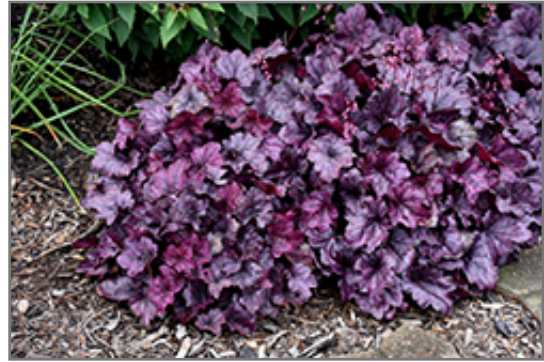
Wild Rose Coral Bells

This is a relatively low maintenance plant, and should be cut back in late fall in preparation for winter. It is a good choice for attracting hummingbirds to your yard. It has no significant negative characteristics.