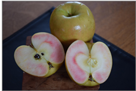
Pink Pearl Apple fruit and flesh

Pink Pearl Apple features showy clusters of lightly-scented white flowers with shell pink overtones along the branches from early to mid spring, which emerge from distinctive red flower buds. It has forest green deciduous foliage. The pointy leaves turn yellow in fall. The fruits are showy chartreuse apples with a rose blush, which are carried in abundance from mid to late summer. The fruit can be messy if allowed to drop on the lawn or walkways, and may require occasional clean-up.