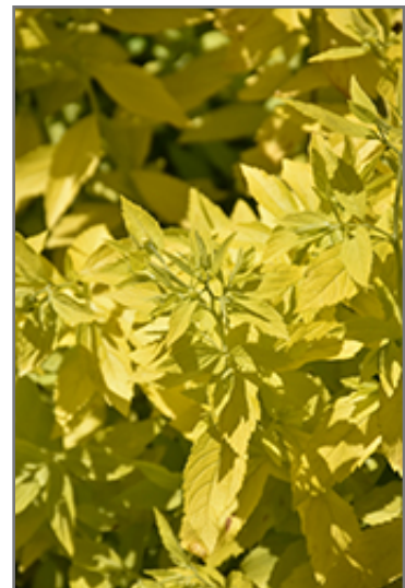
White Gold Spiraea foliage