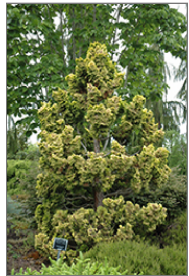
Dwarf Golden Hinoki Falsecypress