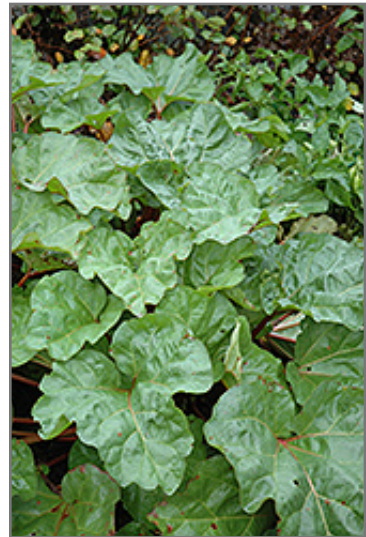
Valentine Rhubarb foliage

This is an herbaceous perennial with a rigidly upright and towering form. Its wonderfully bold, coarse texture can be very effective in a balanced garden composition. This plant will require occasional maintenance and upkeep, and can be pruned at anytime. Deer don't particularly care for this plant and will usually leave it alone in favor of tastier treats. It has no significant negative characteristics.