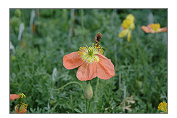
Alpine Poppy flowers