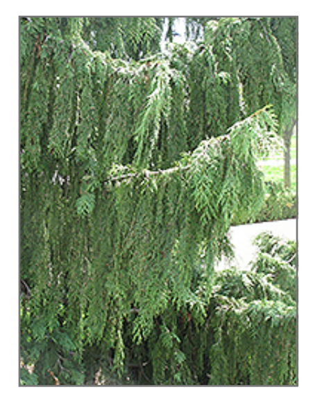
Nootka Cypress foliage