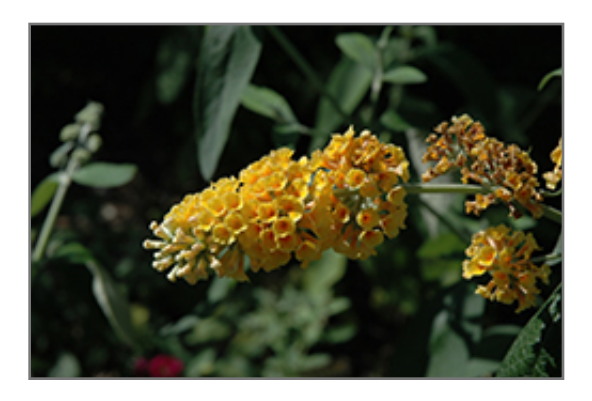
Honeycomb Butterfly Bush flowers

Honeycomb Butterfly Bush is recommended for the following landscape applications;