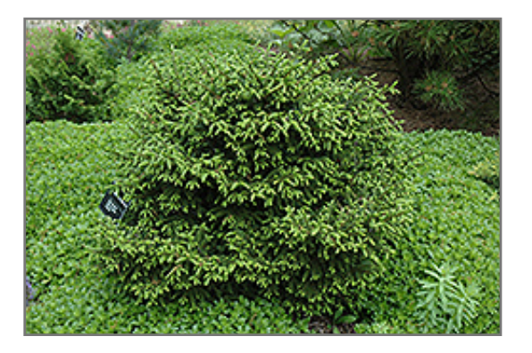
Nigra Compacta Oriental Spruce

Nigra Compacta Oriental Spruce is a dwarf conifer which is primarily valued in the landscape or garden for its distinctively pyramidal habit of growth. It has attractive dark green evergreen foliage which emerges lime green in spring. The glossy needles are highly ornamental and remain dark green throughout the winter. The rough brown bark adds an interesting dimension to the landscape.