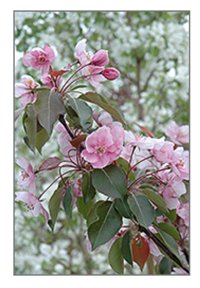
Selkirk Flowering Crab flowers