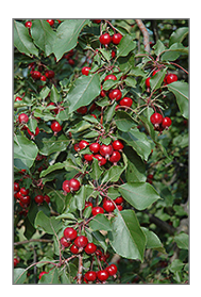
Selkirk Flowering Crab fruit

* This is a 'special order' plant - contact store for details