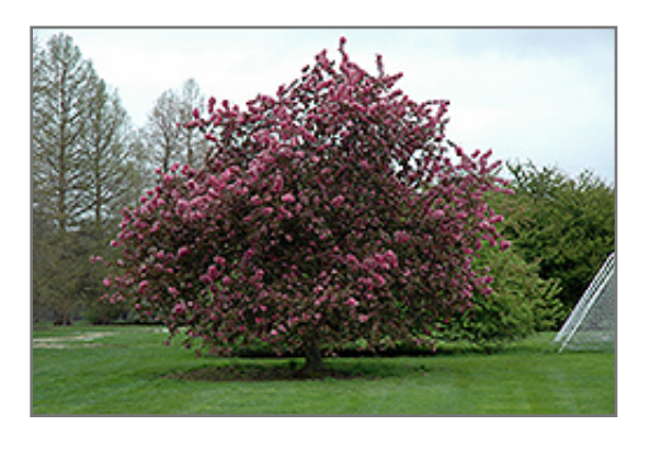
Selkirk Flowering Crab in bloom