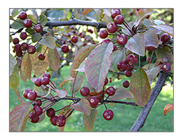
Indian Summer Flowering Crab foliage

* This is a 'special order' plant - contact store for details