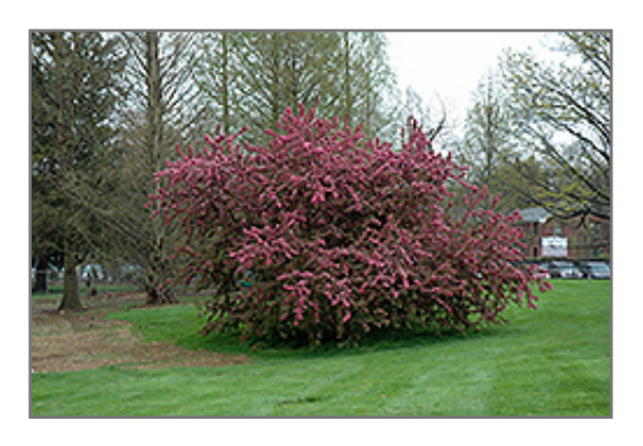
Indian Summer Flowering Crab in bloom

This tree will require occasional maintenance and upkeep, and is best pruned in late winter once the threat of extreme cold has passed. It has no significant negative characteristics.