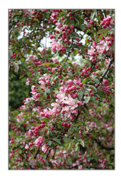
Indian Summer Flowering Crab flowers